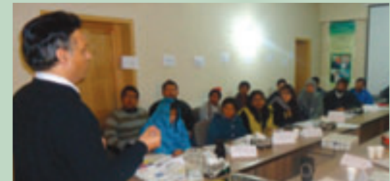
Students listen intently to the guest lectures during their trip.

A number of outdoor activities like a treasure hunt, bonfire, and a walk of Punjab house were also organized as part of fun character-building exercises.