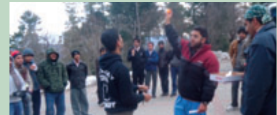
Students take part in a treasure hunt as part of their capacity building training