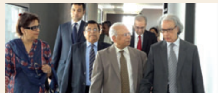
Dean and Director, IBA, Dr. Ishrat Husain, takes members of the Board of Governors on a tour of the newly renovated buildings of the Main Campus.

After becoming independent in 1994, the re-constituted IBA Board of Governors now consists of 17 members and so far - in less than 20 years - 74 meetings have been held.