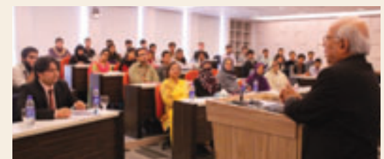
Dean and Director, Dr. Ishrat Husain, addresses the first batch of students of the IBA Foundation Program at the Orientation Session in December, 2012.

Forty students were selected for the first batch, graduating in 2013. They attended the Orientation along with the lead faculty and mentors of the IBA.