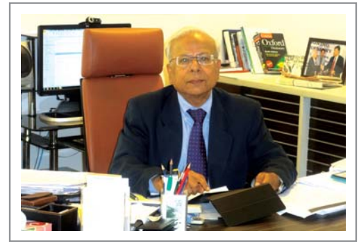
Dean & Director, Dr. Ishrat Husain

IBA doesn't consider itself an old institute rather a learning Organization that is continuously reinventing itself. We have introduced new programs, transformed ourselves from a purely teaching to research institution, introduced case study method and experiential learning as new pedagogical tools, set up a centre for Entrepreneurial development, extended outreach to the community and businesses. In doing so we had to invest massively in infrastructure and ICT., recruit top quality faculty many of them either holding PhDs from best universities around the globe or in the process of pursuing PhD. Our motto to prepare the leaders for tomorrow is practically translated through a holistic personality development of our students combining competencies with character and commitment. Our need blind admission policy and National Talent Hunt program have enabled many financially challenged students from backward districts to move up in the social ladder.