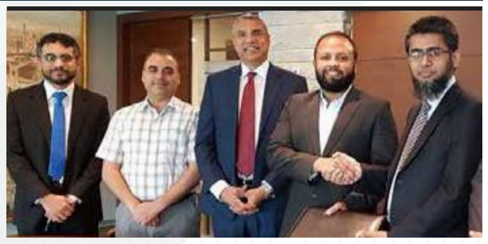
June 28, 2018: IBA-CEIF signed an MoU with CEIF, IMSciences for authoring a globally impactful book on Innovations in Islamic Finance.