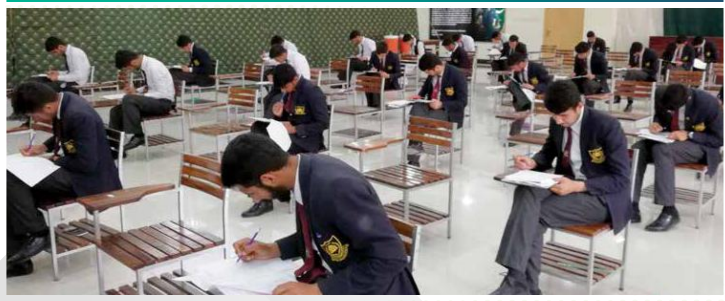
March 25, 2018: IBA Karachi conducted the Talent Hunt Program (Scholarship) assessment test for the Batch 2018 of IBA Ihsan Trust National Talent Hunt Program and IBA-CDP Sindh Talent Hunt Program with the support and help of CDP, GoS and Ihsan Trust - Meezan Bank. It has been the largest test under the cap of Talent Hunt Programs in which 4458 students from across Pakistan were shortlisted and invited for the test in 14 cities.