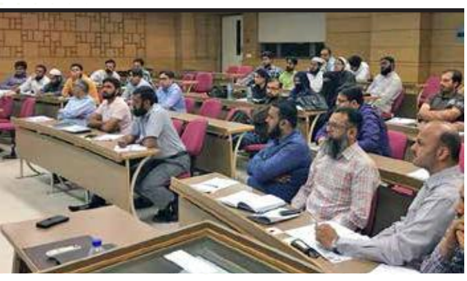
April 21, 2018: IBA CEIF welcomed the fourth batch of the "Advanced Certificate in AAOIFI Shariah Standards (ACSS)".