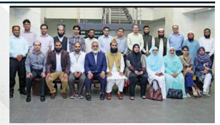
May 05-08, 2018: IBA CEIF successfully conducted a four-day training on "Islamic Finance for Academicians".