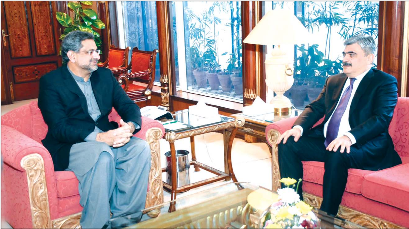
ISLAMABAD: Samir Sharifov, Finance Minister of the Republic of Azerbaijan called on Prime Minister Shahid Khaqan Abbasi, here at Prime Minister's Office, Monday.