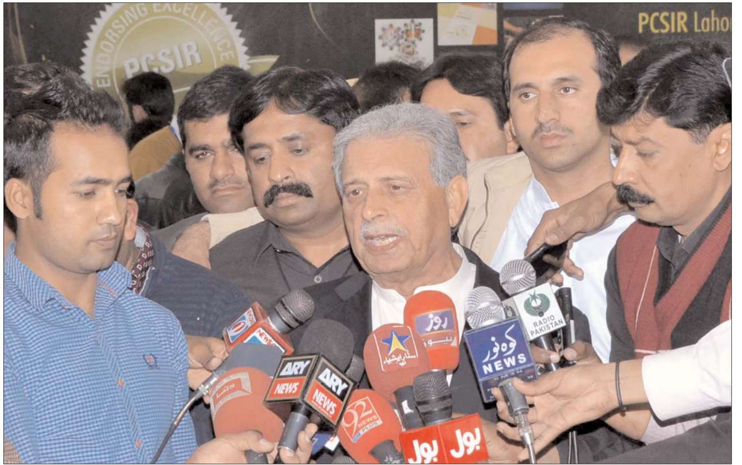
LAHORE: Federal Minister for Defence Production, Science & Technology Rana Tanveer Hussain talking to media, here Monday.

He said the commission was also offering vocational and professional training of different skills for earning respectable living for their families. - NNI