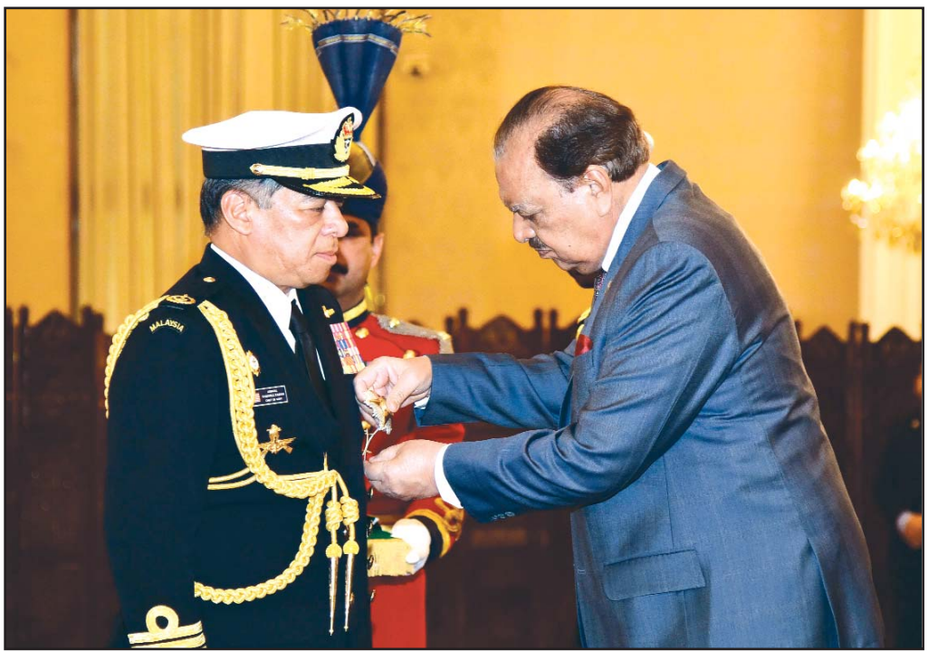
ISLAMABAD: President Mamnoon Hussain conferring Nishan-e-Imtiaz (Military) upon Chief of Royal Malaysian Navy Admiral Tan Sri Ahmad Kamarulzaman HJ Ahmad Badaruddin, here at the Aitwan-e-Sadr, Monday.

ISLAMABAD: Expressing satisfaction on overall progress of various components of Prime Minister's Youth Programme, Prime Minister, Shahid Khaqan Abbasi has said that youth programme, initiated in 2013, was reflective of the priorities of PML-N government to help the youth in becoming the most productive asset of the society and thus enabling them to contribute towards overall socio-economic development of the country. He said the constitution had defined the limits of all institutions and they would have to act within that purview else the country would suffer. It had been witnessed repeatedly that in case of any conflict, it was the country that suffered, he added. "To avoid any conflict, the House should hold a debate. This is not a partisan debate. This is not a party's debate. This is the House's debate," he added. "As far as executive is concerned, government officers are summoned to court, insulted, policies are negated (and)