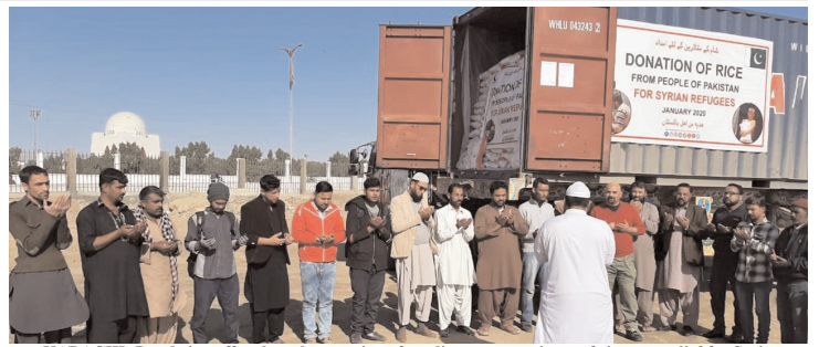
KARACHI: Dua being offered on the occasion of sending two containers of rice as a relief for Syrian refugees by Khubab Foundation.

"Several thousand people from Karachi visit the Keenjhar lake weekly," a local official said. - NNI