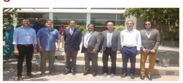
April 14, 2025: IBA Karachi hosted an informative and insightful session titled, "Impact of IBA for Smoothly Handling Commercial Disputes through ADR (Alternative Dispute Resolution)" at the IBA Main Campus. The session aimed to raise awareness about the growing relevance of ADR mechanisms in resolving commercial disputes in