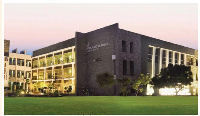
nstitute of Business Administration Karachi (IBA) building.

The IBA Karachi hosted an informative and insightful session titled, "Impact of IBA for Smoothly Handling Commercial Disputes through ADR (Alternative Dispute Resolution)", at the IBA Main Campus.