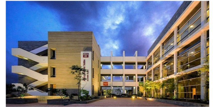
Institute of Business Administration (IBA), Karachi.