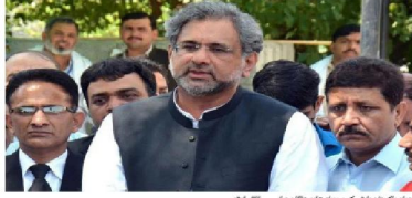
عوام پاکستان ریلی کے سہارے شاہد خاقان عباسی کے ساتھ

عوام پاکستان پارٹی کے سربراہ شاہد خاقان عباسی کا کہنا ہے کہ کراچی کے موجودہ حالات دیکھ کر افسوس ہوتا ہے۔